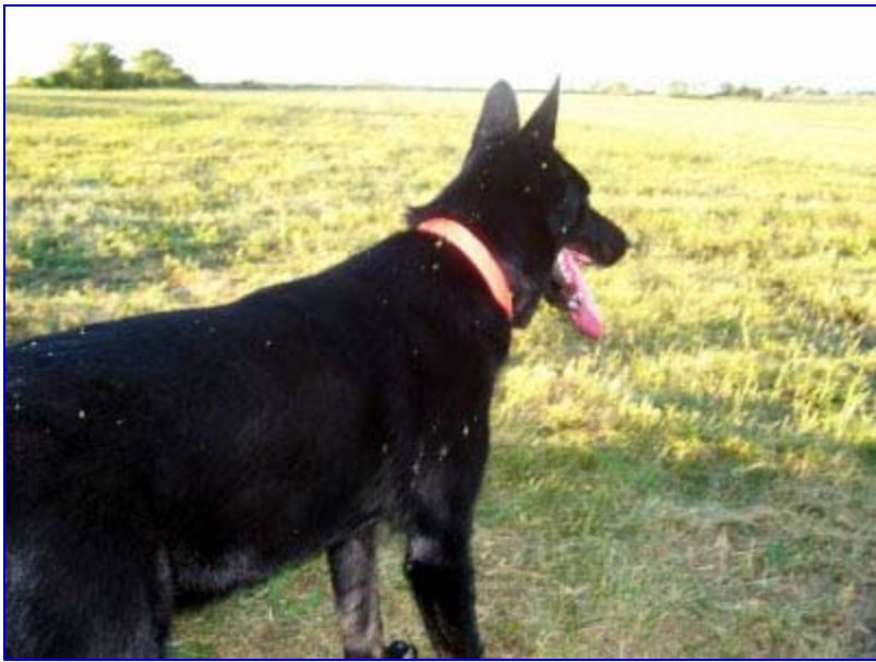
May 9 2006